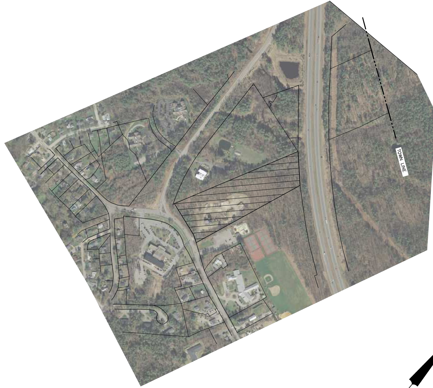
AERIAL PHOTO & TAX MAP SKETCH EXETER, N.H. SCALE: 1" = ±300'