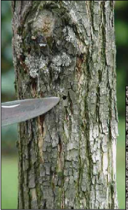
D-shaped exit holes, 1/18 inch