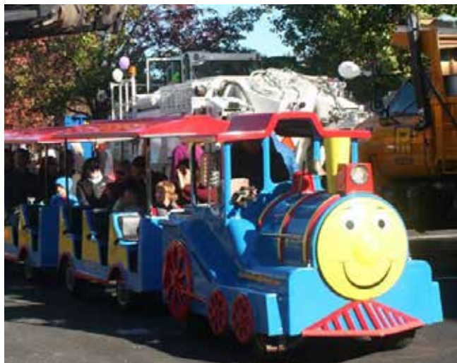
Fun on the Roaming Railroad.

We also receive funding from the towns that we serve. Since 1985, we've been asking individual towns to include us in their annual budgets. These funds are essential to us serving children and families from those very towns. Town contributions aren't just the right thing to do, they're also the smart thing. For every $1 spent on early intervention services, school systems will later save anywhere from $4 to $7 in special education costs ( Educational Resource and Information Center )! So a big thank you to: Brentwood, Deerfield, East Kingston, Epping, Exeter, Fremont, Greenland, Hampton, Hampton Falls, Kensington, Kingston, New Castle, Newfields, Newington, Newmarket, North Hampton, Northwood, Nottingham, Portsmouth, Raymond, Rye, Seabrook, South Hampton, and Stratham for supporting RMCC!