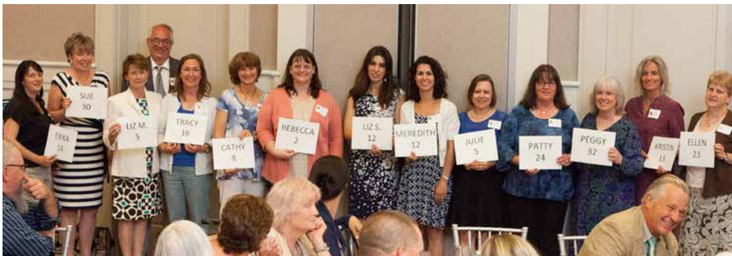
Members of our staff attending the Annual Meeting Celebration displaying the number of years they have worked at RMCC!