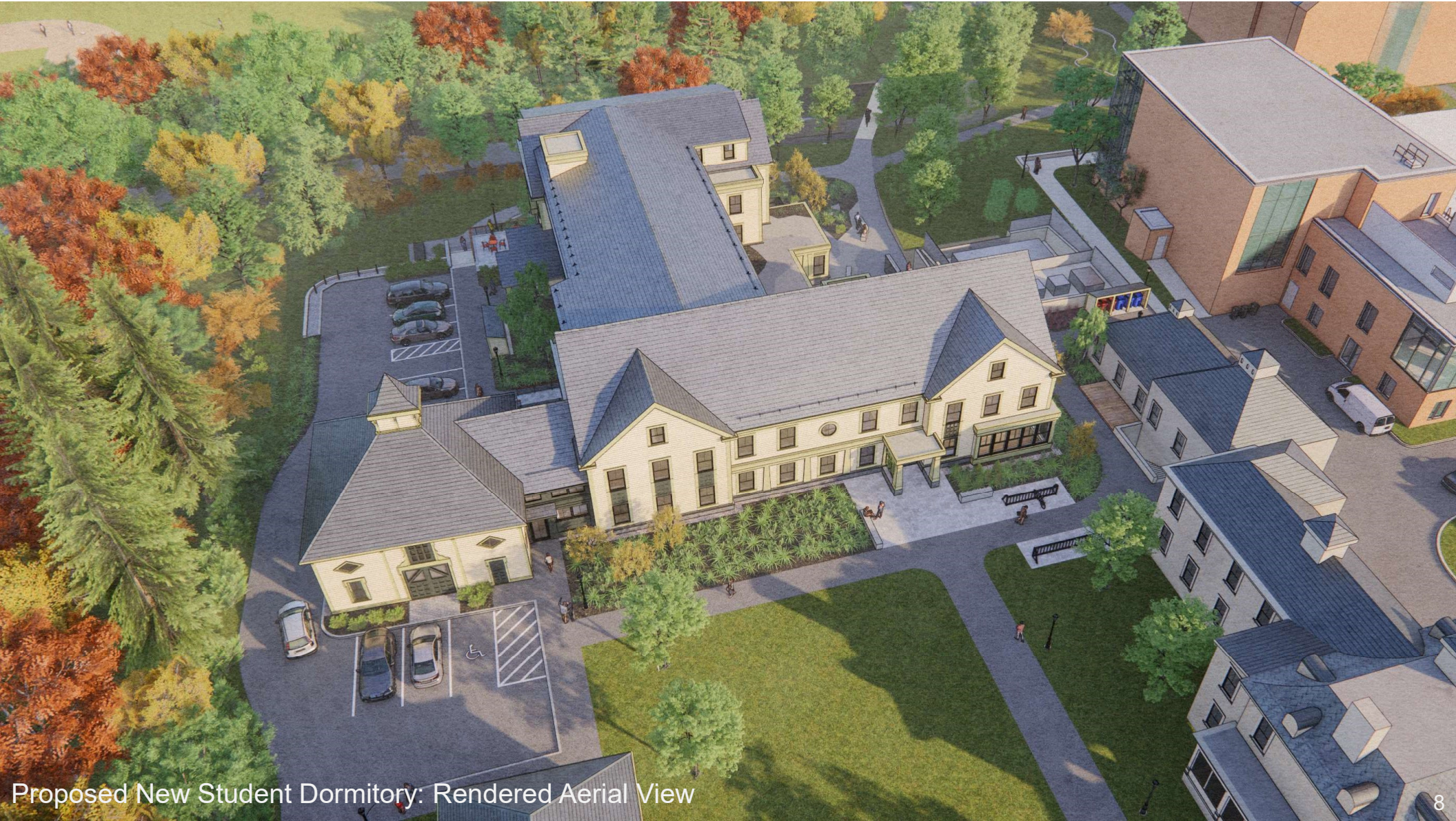
Proposed New Student Dormitory: Rendered Aerial View