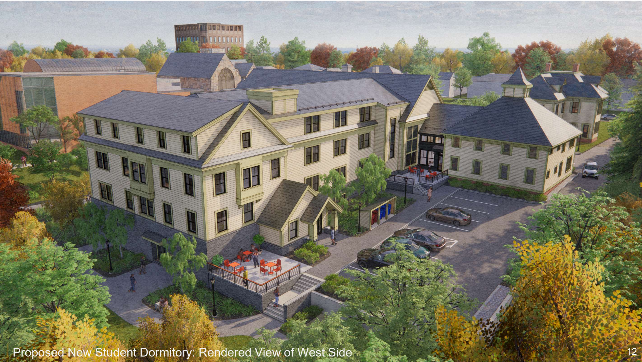
Proposed New Student Dormitory: Rendered View of West Side