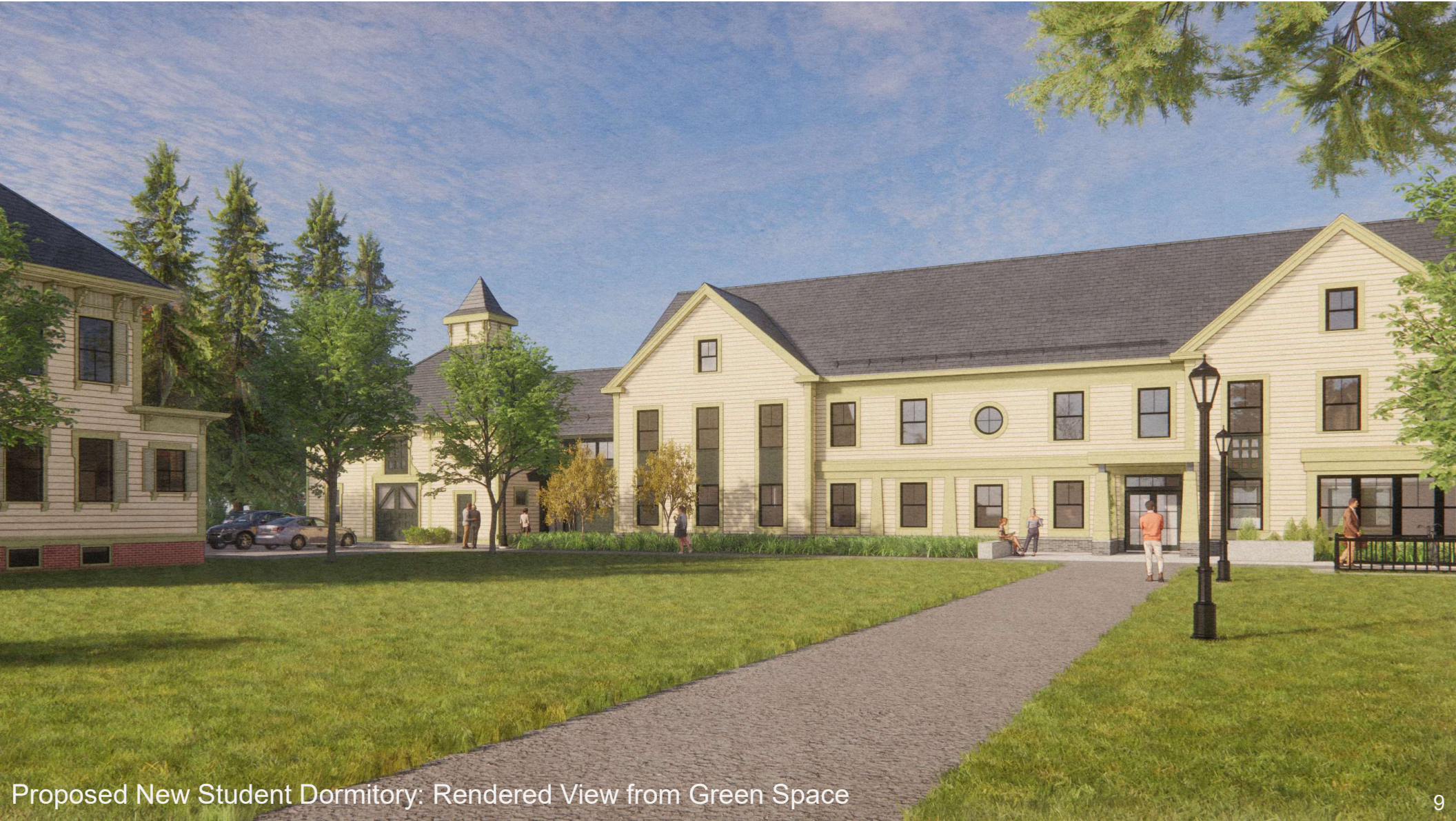
Proposed New Student Dormitory: Rendered View from Green Space