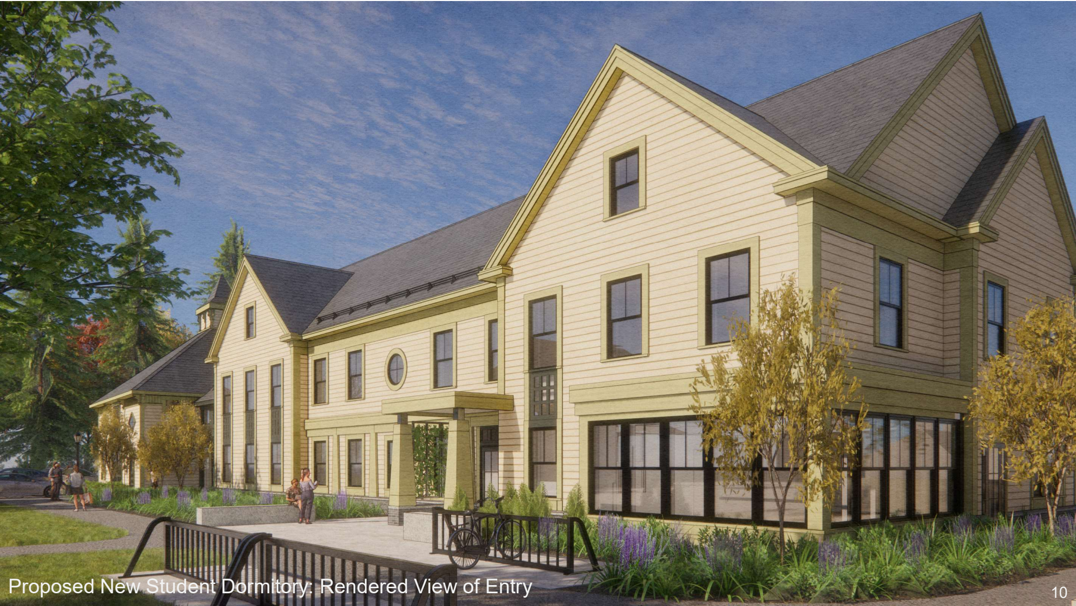
Proposed New Student Dormitory: Rendered View of Entry