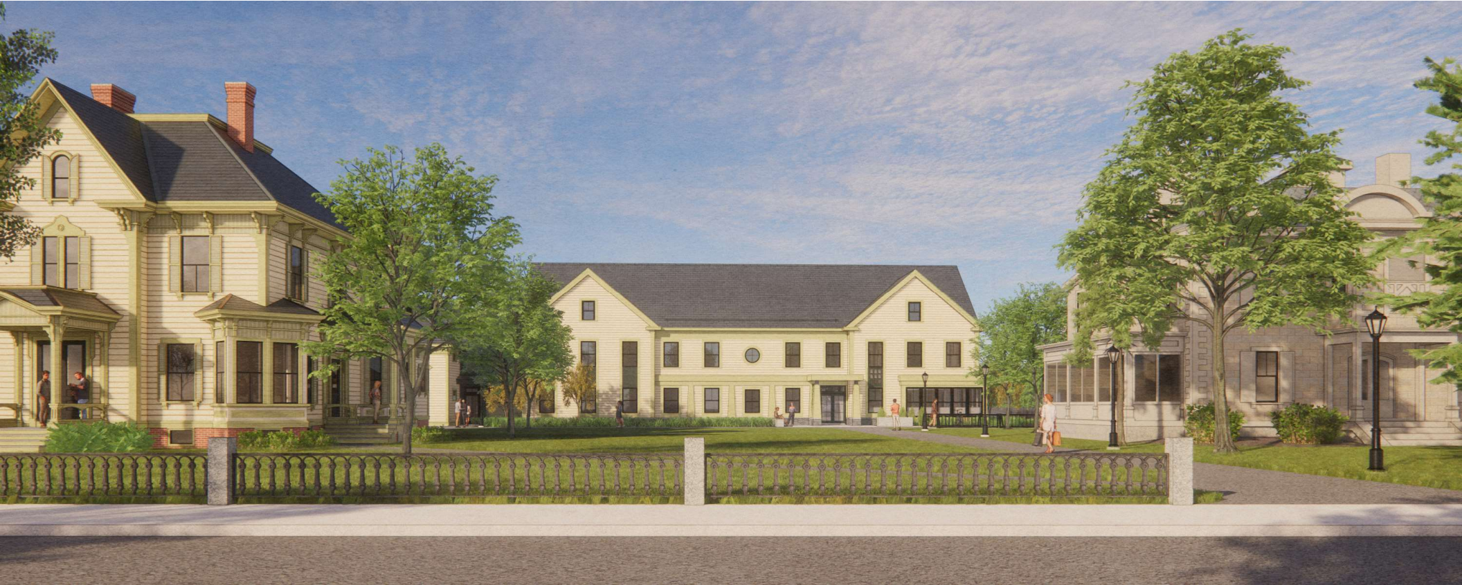
New Student Dormitory: View from Front Street