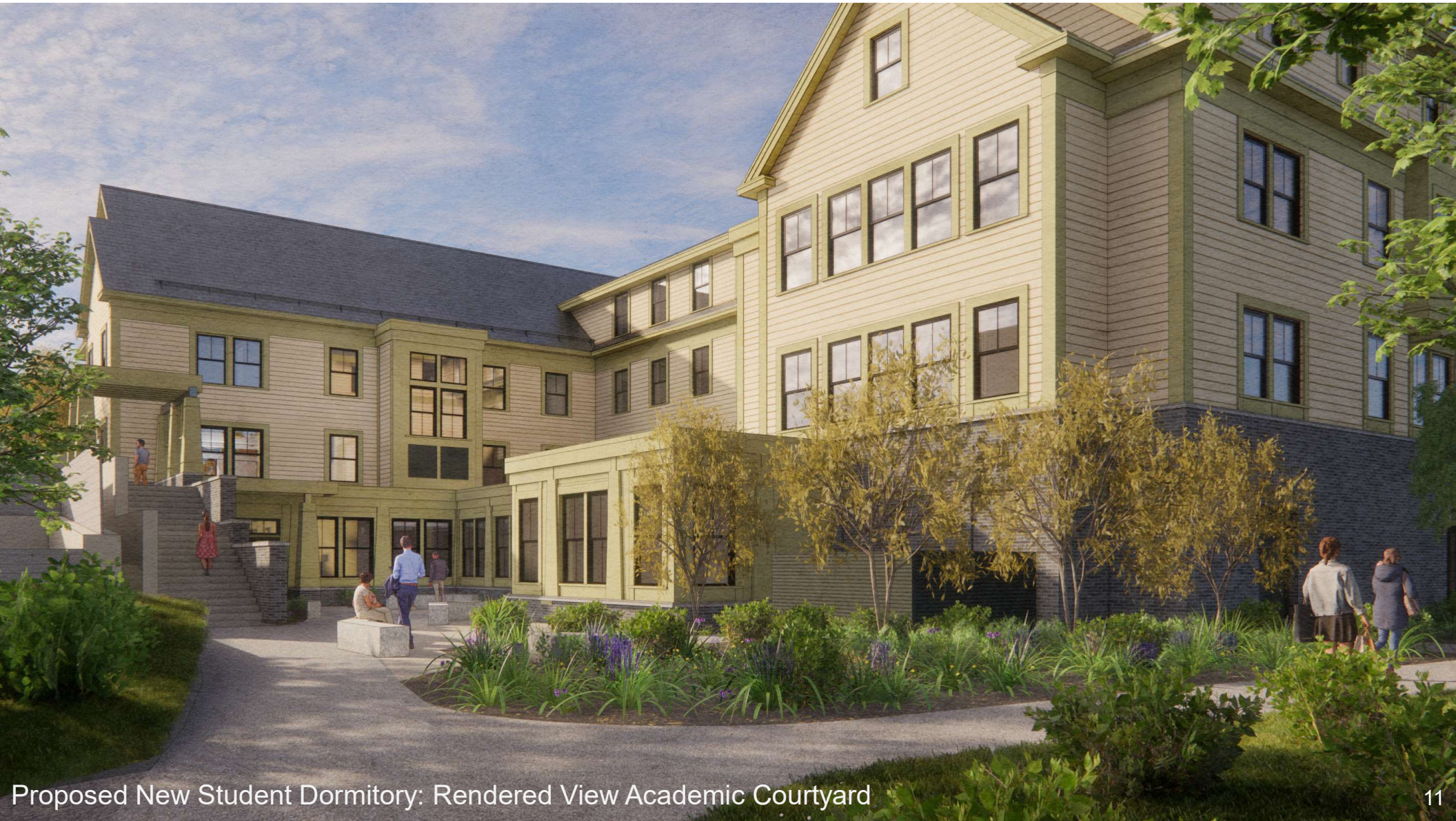
Proposed New Student Dormitory: Rendered View Academic Courtyard