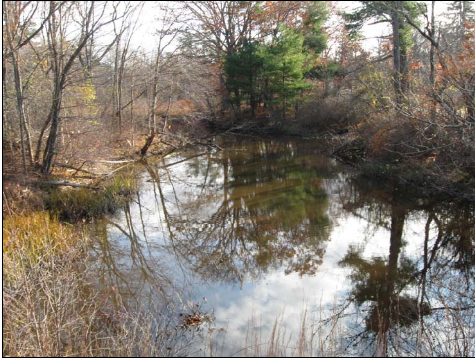
Photo 20 Little River looking upstream from Court Street Bridge