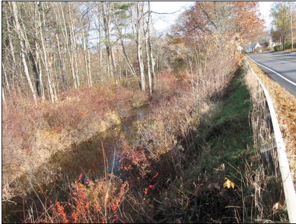
Photo 22 Little River looking upstream from Linden Street Bridge