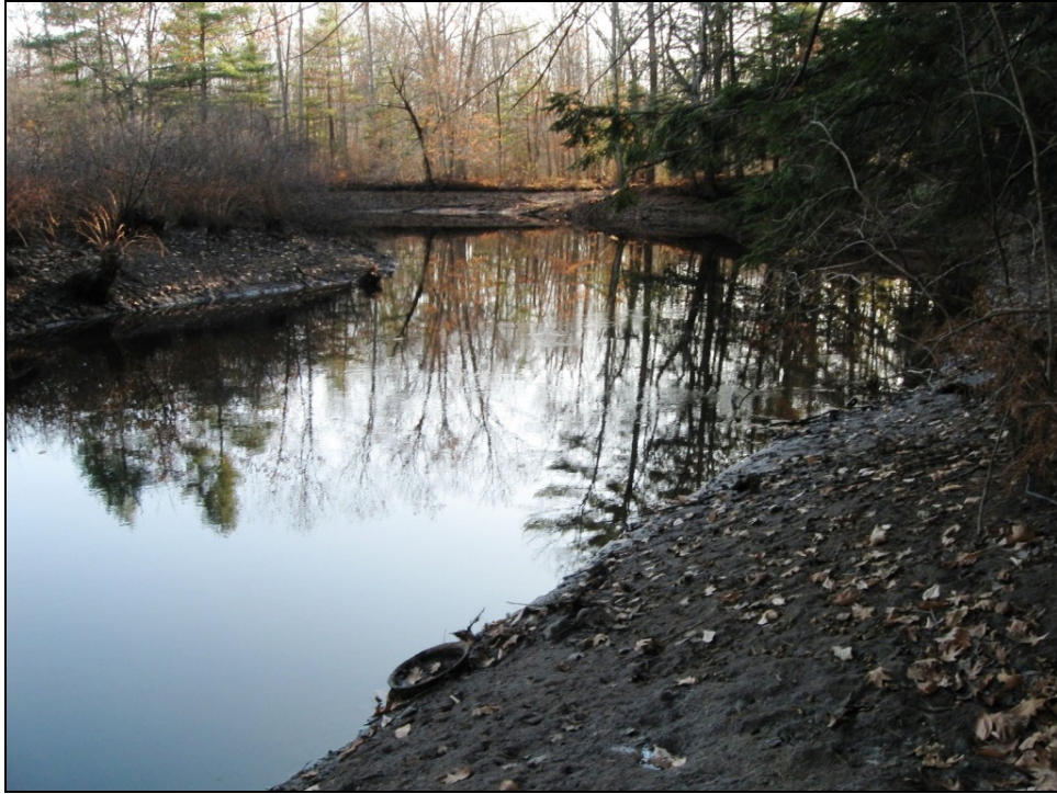
Photo 4 River East of Larry Lane