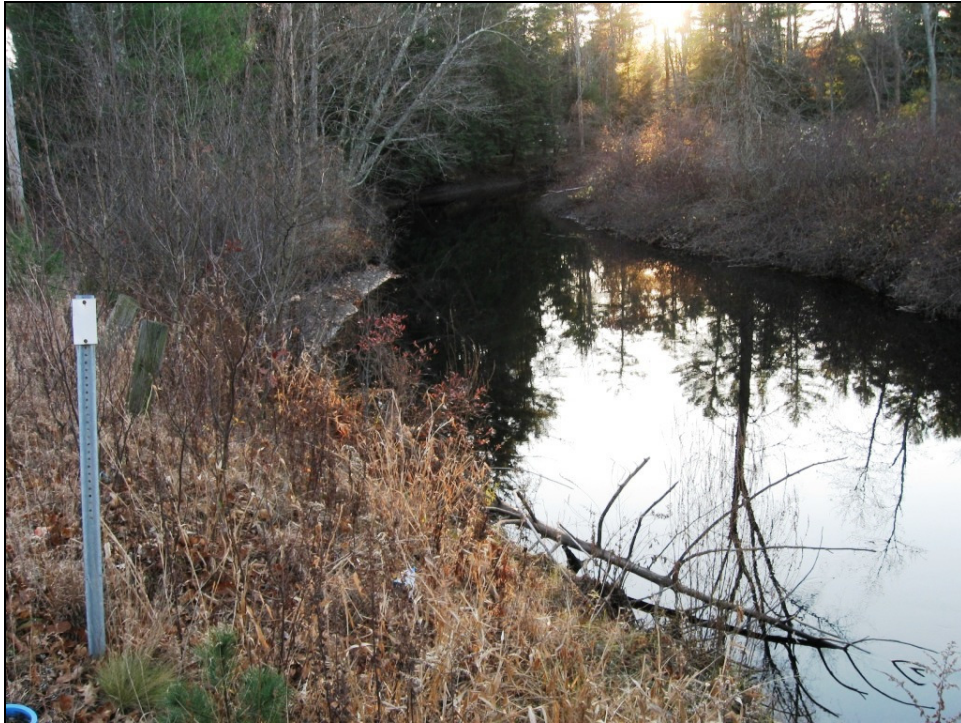
Photo 2 Exeter River at Court Street Bridge