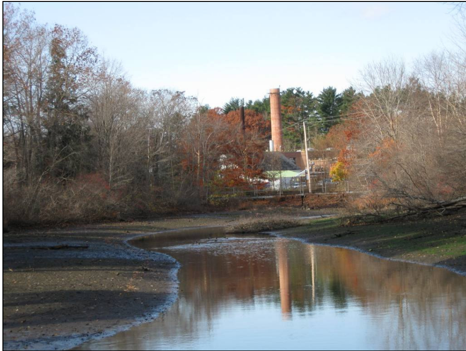
Photo 10 Little River from PEA footbridge towards Little River