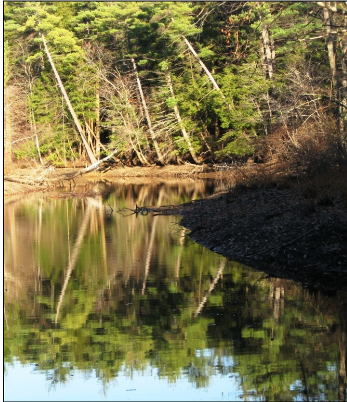
Photo 6 River looking upstream from Gilman boat launch