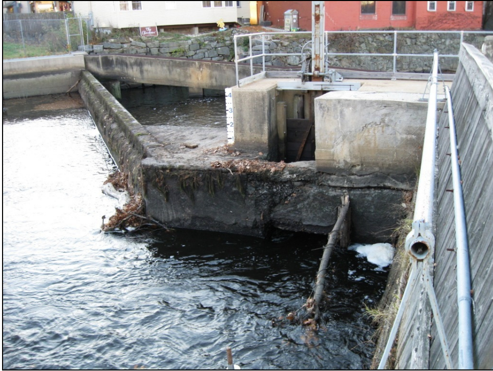
Photo 18 Outcrops near Great Dam