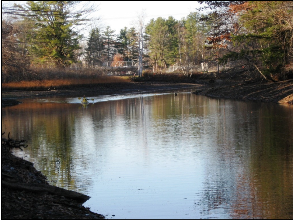
Photo 8 River across from Intake