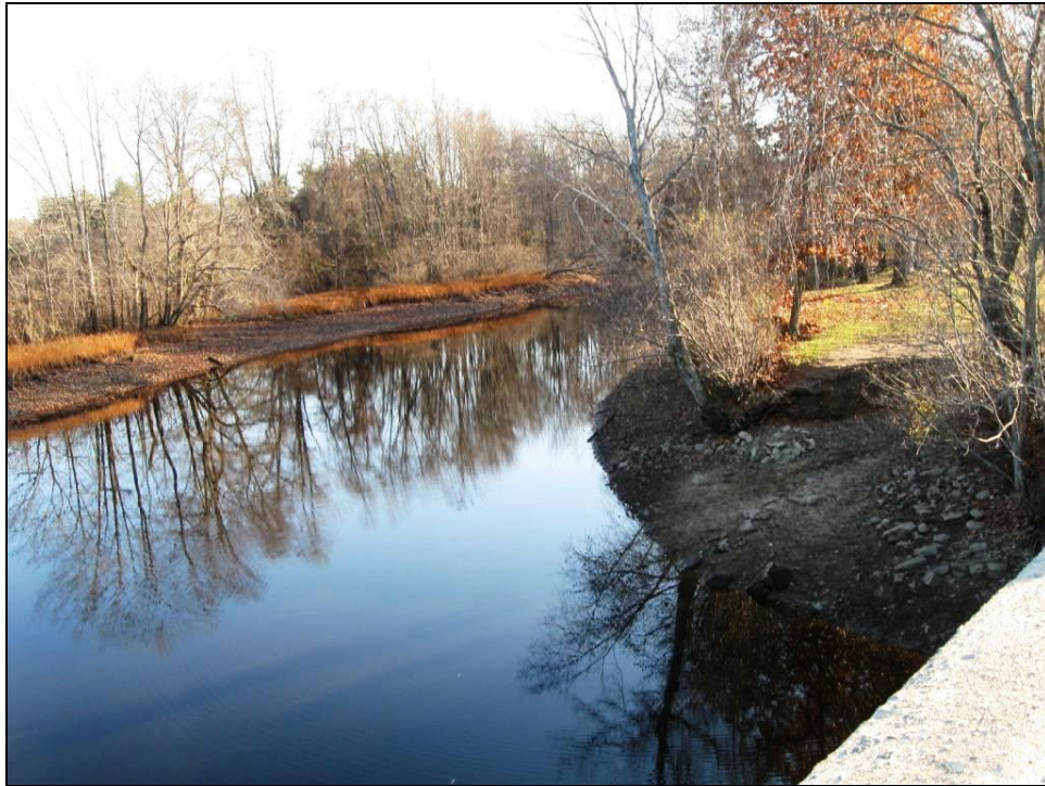
Photo 14 River near High Street