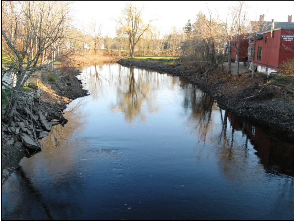
Photo 16 Dam from High Street