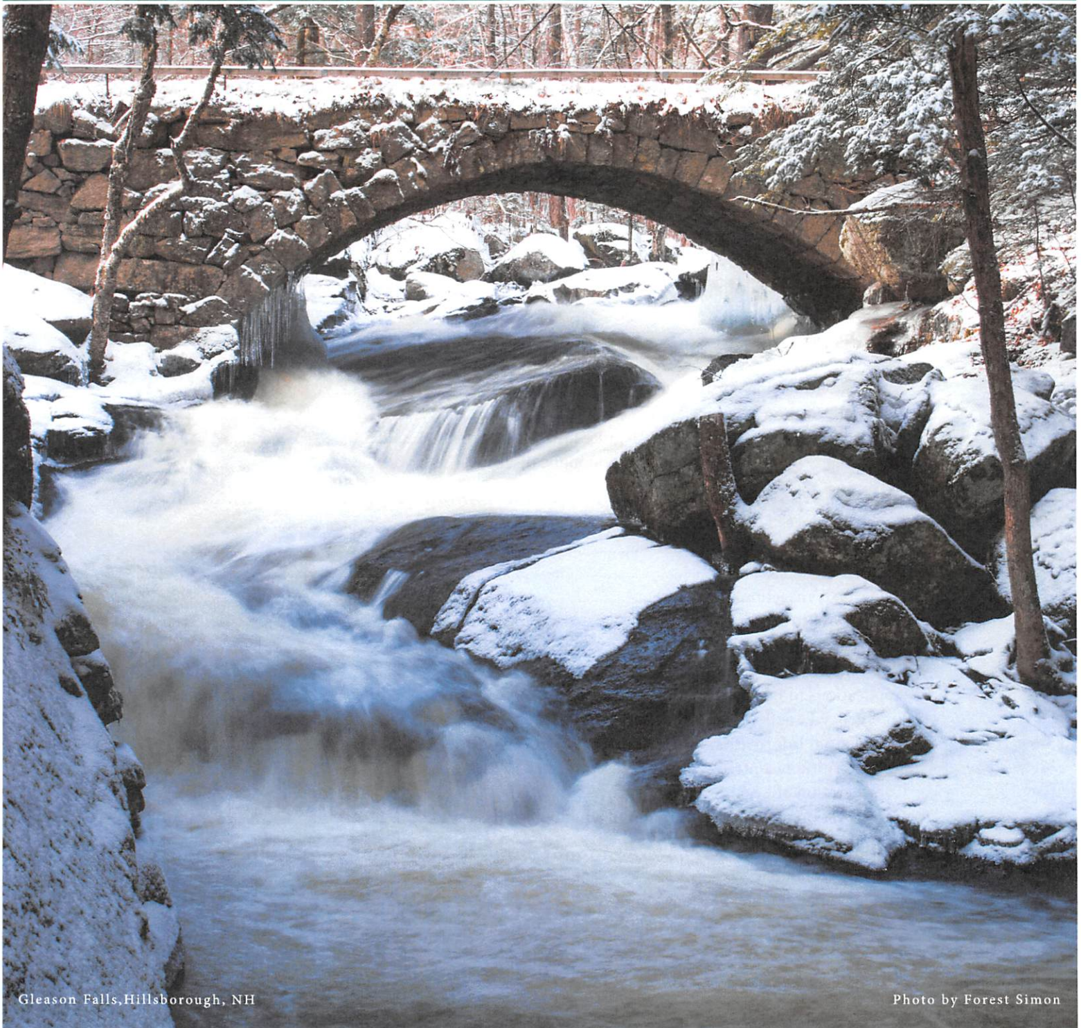
Gleason Falls, Hillsborough, NH